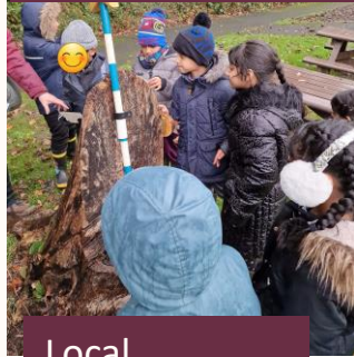
Local geography walks