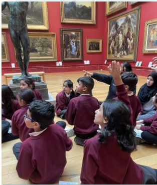
Year 4 trip to Leeds Art Gallery