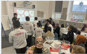
Year 6 parent and child cooking session