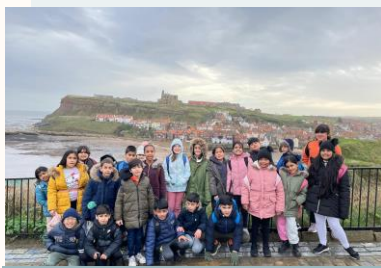
Year 4 Whitby residential