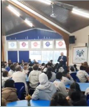
Year 6 conference