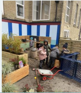
New early years outdoor