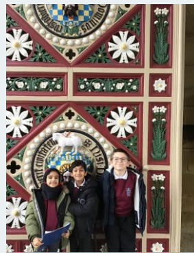
Year 3 explore Halifax